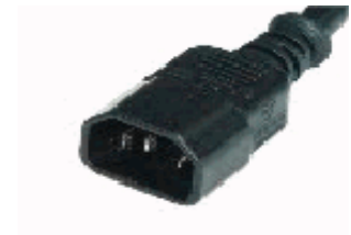
IEC320 C14 10A plug