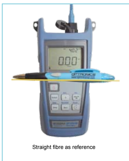
Straight fibre as reference