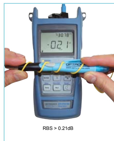
RBS > 0.21dB