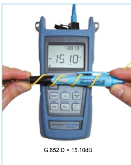
G.652.D > 15.10dB