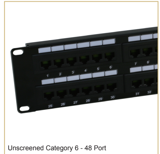
Unscreened Category 6 - 48 Port